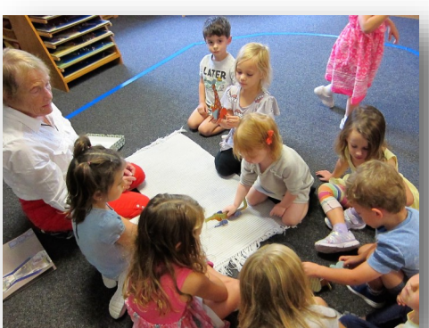
Art: Yarn apples (An apple shape was covered with yarn).