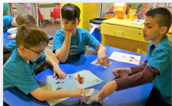
~ Simple Pulley Machine ~

The earlier we allow our children to socialize and realize the importance of teamwork and cooperative learning, the more prepared they will be to work in group settings throughout the course of their life.