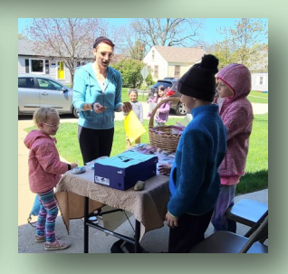
Way to go, Montessori Pathways students! You all are having such big hearts!